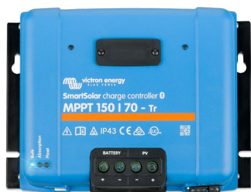
SmartSolar Charge Controller MPPT 150/70-Tr without optional display