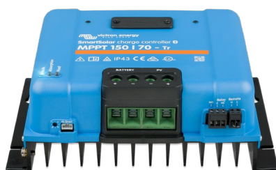
SmartSolar Charge Controller MPPT 150/70-Tr with optional display